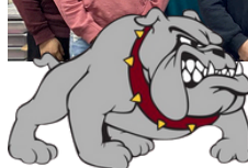
70 9th & 10th graders on 1/31